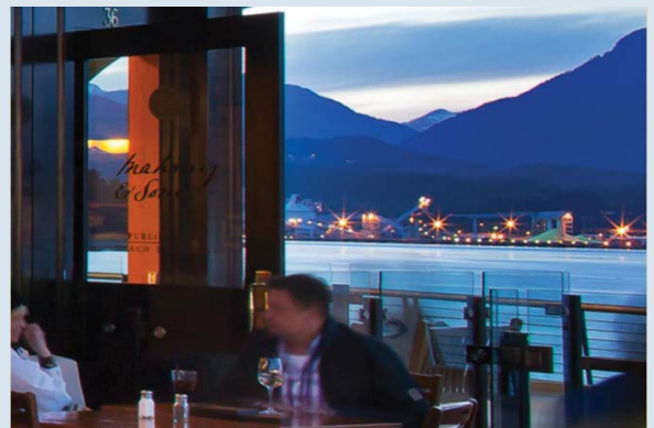
Mahoney & Sons Irish Pub